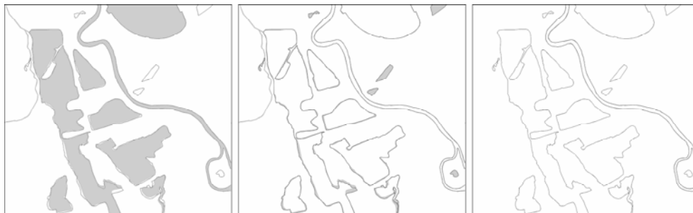
Figure 3: Results from the alignment process: Left - ATKIS (solid lines) and GDF (filled) overlaid, ATKIS and symmetric differences (grey) before alignment (middle), ATKIS and symmetric differences (grey) after alignment.

The result of the adjustment is satisfying: for the objects that are similar, a perfect adaptation could be achieved. In cases, where there are obvious dissimilarities between the objects, also the adaptation was not possible. As a measure for the adaptation quality, the symmetric difference of the two objects after the adjustment is used. In the case of successful 1:1-matches, the measure yields a